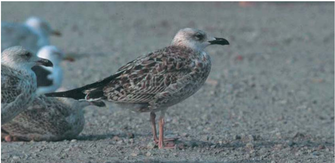
Plate 8. First-winter Mediterranean Yellow-legged Gull Larus michahellis michahellis , Calais, Pas-de-Calais, France, early September 1999. Compared to Atlantic Islands birds, note the whiter head, paler underparts, more chequered appearance and the presence of some new first-winter scapulars. This individual recalls Madeiran birds of the same age, but already lacks the dark markings on the tarsus. Also compare the leg length and scapular patterns.