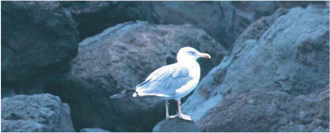
Plate 27. Adult Azorean Yellow-legged Gull Larus michahellis atlantis , Madalena, Pico, Azores, mid August 2000 (Philippe Dubois). This adult in 'winter' plumage has pale yellow legs and a large orange-red spot on the gonyx.