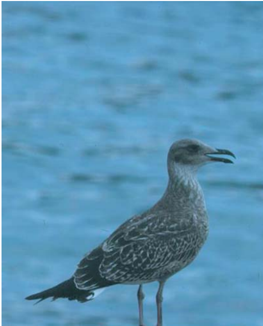
Plate 3. Juvenile Azorean Yellow-legged Gull Larus michahellis atlantis , Madalena, Pico, Azores, mid August 2000. This bird shows no sign of any post-juvenile moult. Note the uniform brown upper back. The tertials recall those typically shown by many juvenile Lesser Black-backed Gulls.