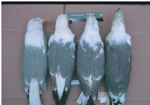
Plate 30. Adult Yellow-legged Gull Larus michahellis specimens, from left to right: 'Mediterranean', Bouches-du-Rhône, France, April 1921; 'Atlantic Moroccan', Essaouira, Morocco, April 1981; 'Madeiran', Salvage Islands, 1978; and 'Azorean', Pico, Azores, September 1930 (MNHN, Paris Philippe Dubois). The mantle colour seems to be clinal from the Mediterranean (palest) birds to the Azorean (darkest) birds. More studies are needed to assign a definite sub-specific name to the birds of Iberia and Morocco, and Madeira and the Canary Islands.