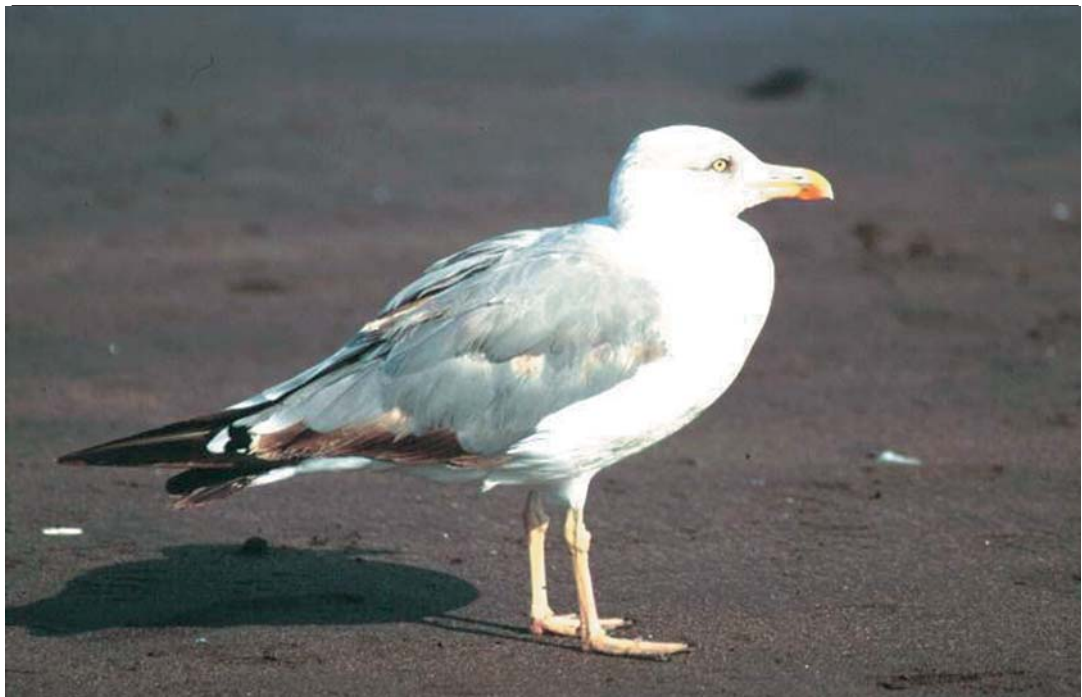
Plate 24. Second-summer/third-winter Canary Yellow-legged Gull Larus michahellis , Canary Islands, late July 1997 ( Frédéric Jiguet ). The plumage is quite similar to that of Azorean birds (with brown secondaries and some greater coverts), but the head is not as darkly streaked on this July bird; the bill is similar to that of Mediterranean birds (nominate michahellis ) of the same age.