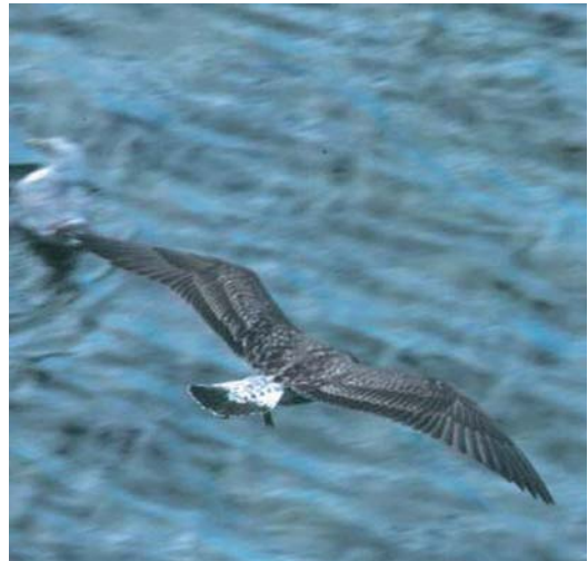
Plate 10. Juvenile Azorean Yellow-legged Gull Larus michahellis atlantis , Lajes, Pico, Azores, mid August 2000. The plain bases to the outer greater coverts form an extra dark bar on the wing (as on some michahellis ). The black band on the tail is broad.