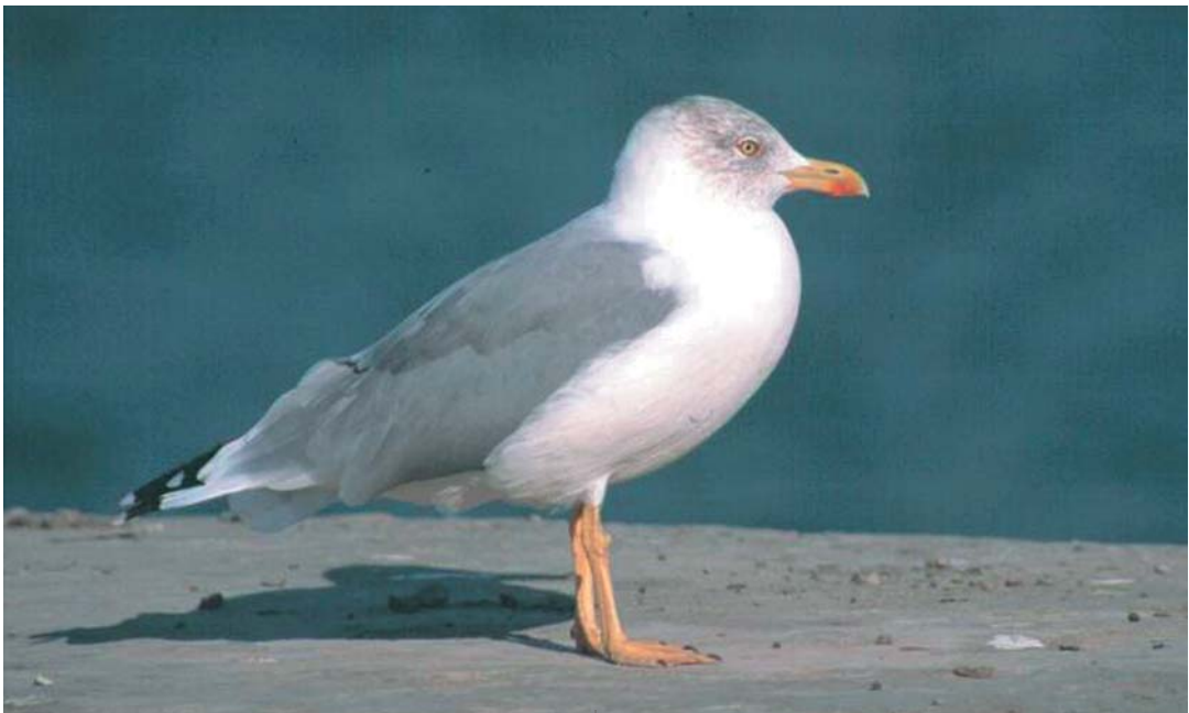
Plate 29. Adult Mediterranean Yellow-legged Gull Larus michahellis michahellis , Boulogne-sur-Mer, Pas-de-Calais, France, September 1997. Note the relatively dark yellow iris.