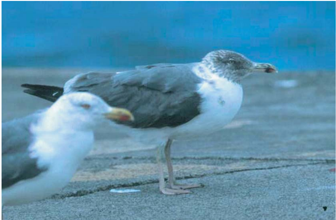
Plate 23. Second-summer/third-winter Azorean Yellow-legged Gull Larus michahellis atlantis , Madalena, Pico, Azores, mid August 2000. The heavy dark grey streaking on the head (especially the forehead, lores and throat) is typical and makes birds look 'hooded' at a distance. Note also the almost-adult grey plumage.