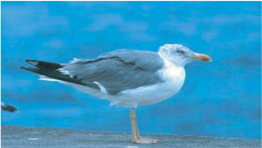
Plate 26. Adult Azorean Yellow-legged Gull Larus michahellis atlantis , Madalena, Pico, Azores, mid August 2000. This bird's primary moult has reached P5, and it has very worn tertials. It has rather heavy streaking on the face. Note the whitish iris typical of Atlantic Islands birds; Mediterranean birds generally have darker, yellower irises.

During my stay in the Azores, in August 2000, I made two interesting observations. Firstly, I saw at least two adults with definitely pale pink legs (at Lajes, Pico). At first, I thought that they might be argenteus/argentatus , or even smithsonianus , but the mantle was too dark a grey and the moulting primary pattern did not fit with these taxa, so perhaps occasional atlantis can have pink legs. And secondly, I saw two separate adults (again at Lajes, Pico, and at Lagoa Rasa, Flores) the same size as typical atlantis , but with the upperparts a shade darker grey, the wings longer, the legs and bill bright yellow, with a bright red spot on the gonys, the iris bright yellow (for two birds) and the head completely white. These birds, which appeared not to be Lesser Black-backed Gulls, stood out from the other adult atlantis .