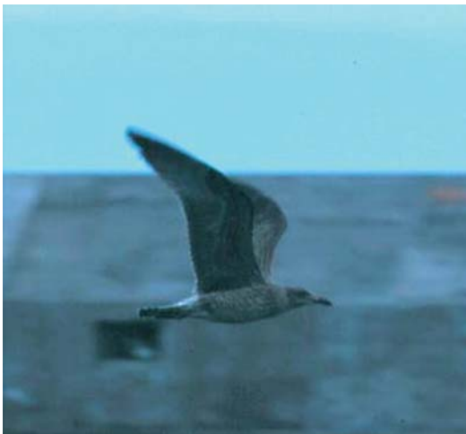
Plate 11. Juvenile Azorean Yellow-legged Gull Larus michahellis atlantis , Madalena, Pico, Azores, mid August 2000. Note the dark underwing pattern and the dark body; such an individual might recall an American Herring Gull L. (argentatus) smithsonianus .