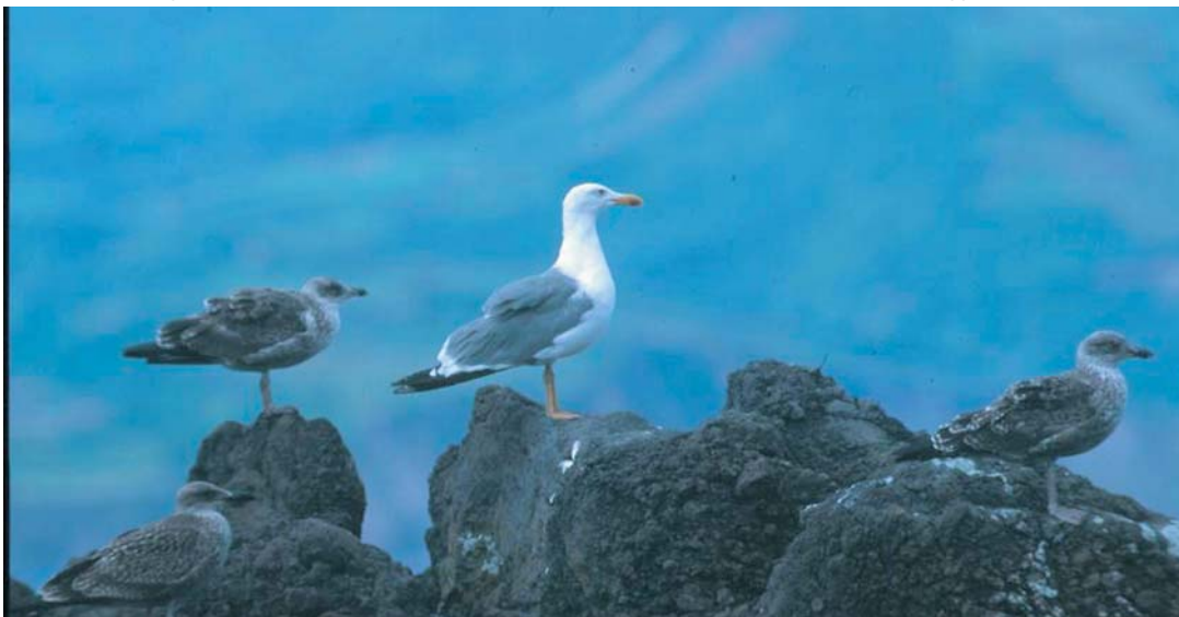
Plate 1. Azorean Yellow-legged Gulls Larus michahellis atlantis , Madalena, Pico, Azores, mid August 2000, adult (centre), with one juvenile and two first-summer/second-winters. This powerful and heavily-built adult is probably a male; it is in summer plumage, with an almost completely white head. Note that atlantis can appear rather short-legged.

This paper does not pretend to be an exhaustive treatment of the identification of atlantis and the other large gulls from the Macaronesian Islands. Its main aim is to present a photographic gallery of their appearance. The information presented here is based mainly on personal observations made on the Canary Islands in September 1991 and on the Azores in August 2000, with further information provided by other observers, particularly from Madeira (S. Nicolle pers. com. and Regan 1999), together with specimens from the Azores, Atlantic Morocco and Selvagem Grande (Madeira) examined at the Muséum National d'Histoire Naturelle (Paris).