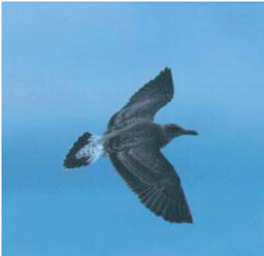
Plate 9. Juvenile Azorean Yellow-legged Gull Larus michahellis atlantis , Madalena, Pico, Azores, August 2000 (Philippe Dubois). The overall rather uniform dark upperparts contrast strongly with the whitish rump and uppertail-coverts. Note the white at the base of the outer rectrices.