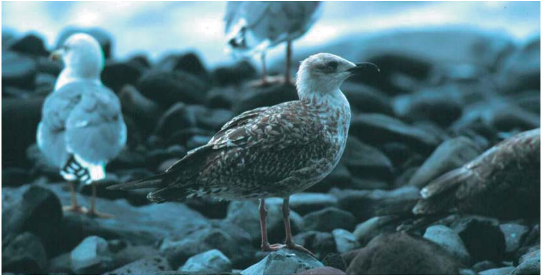
Plate 7. First-winter Madeiran Yellow-legged Gull Larus michahellis , Madeira, September 1999. This bird shows worn tertials and some second-generation scapulars, indicating that it has begun its post-juvenile moult. Note the paler head and underparts and warmer tone on the upperparts than Azorean Yellow-legged Gulls of the same age.