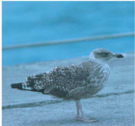
Plate 17. First-summer/second-winter Azorean Yellow-legged Gull Larus michahellis atlantis , Madalena, Pico, Azores, mid August 2000 (Philippe Dubois). A paler and much more chequered individual. Note the pinkish base to the bill and the whitish eye; these features give a characteristic appearance to birds at this age.