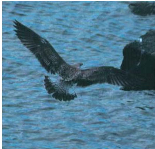
Plate 19. First-summer/second-winter Azorean Yellow-legged Gull Larus michahellis atlantis , Lajes, Pico, Azores, mid August 2000 (Philippe Dubois). In flight, atlantis of this age can appear more 'immature' in pattern than typical michahellis .