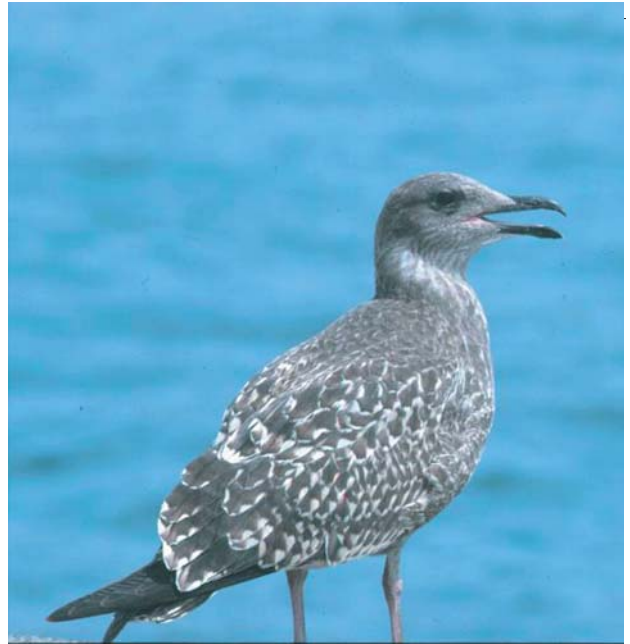
Plate 4. Juvenile Azorean Yellow-legged Gull Larus michahellis atlantis , Madalena, Pico, Azores, mid August 2000 (Philippe Dubois). A paler individual with a more chequered pattern, especially on the scapulars, and on the tertials, which have white notches. As in graellsii/intermedius and michahellis , the juvenile plumage of atlantis is variable.