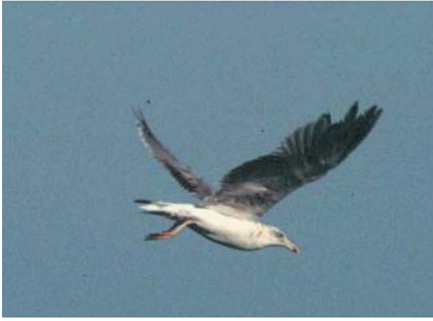
Plate 25. Second-summer/third-winter Canary Yellow-legged Gull Larus michahellis , Canary Islands, late July 1997 (Frédéric Jiguet). The underwing can still be very dark at this age.