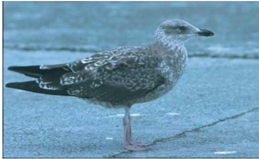
Plate 16. First-summer/second-winter Azorean Yellow-legged Gull Larus michahellis atlantis , Madalena, Pico, Azores, mid August 2000. This bird is slightly paler and more patterned than the bird in Plate 15. The second generation greater coverts are quite uniform, and dark markings remain on the legs, while the eye is darker and browner.