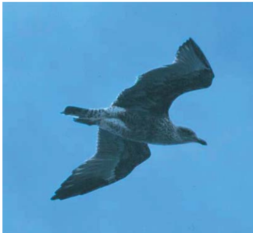
Plate 18. First-summer/second-winter Azorean Yellow-legged Gull Larus michahellis atlantis , Madalena, Pico, Azores, mid August 2000 (Philippe Dubois). Even in this plumage, the Azorean birds have an overall dark appearance in flight initially recalling some American Herring Gulls L. (a.) smithsonianus of the same age – although the bill pattern is different.