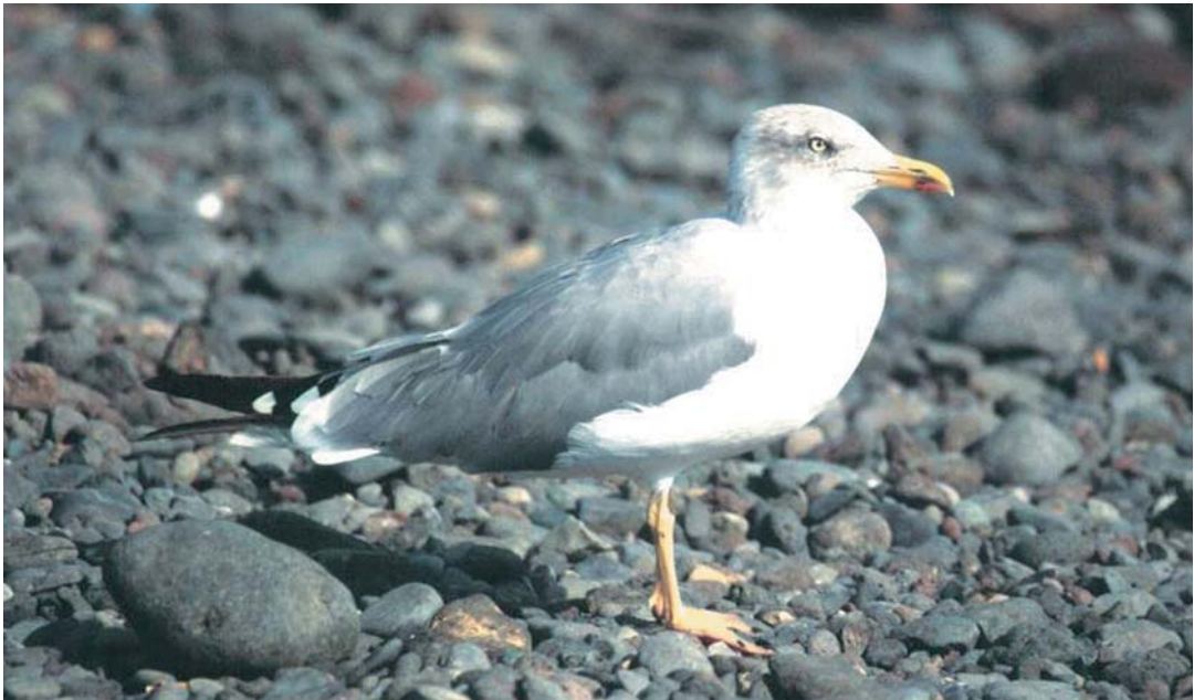
Plate 28. Near-adult Canary Yellow-legged Gull Larus michahellis , Canary Islands, late July 1997. The small black dot on the lower mandible may be a sign of immaturity; it may be a fourth-winter bird. Note the very pale yellowish eye.