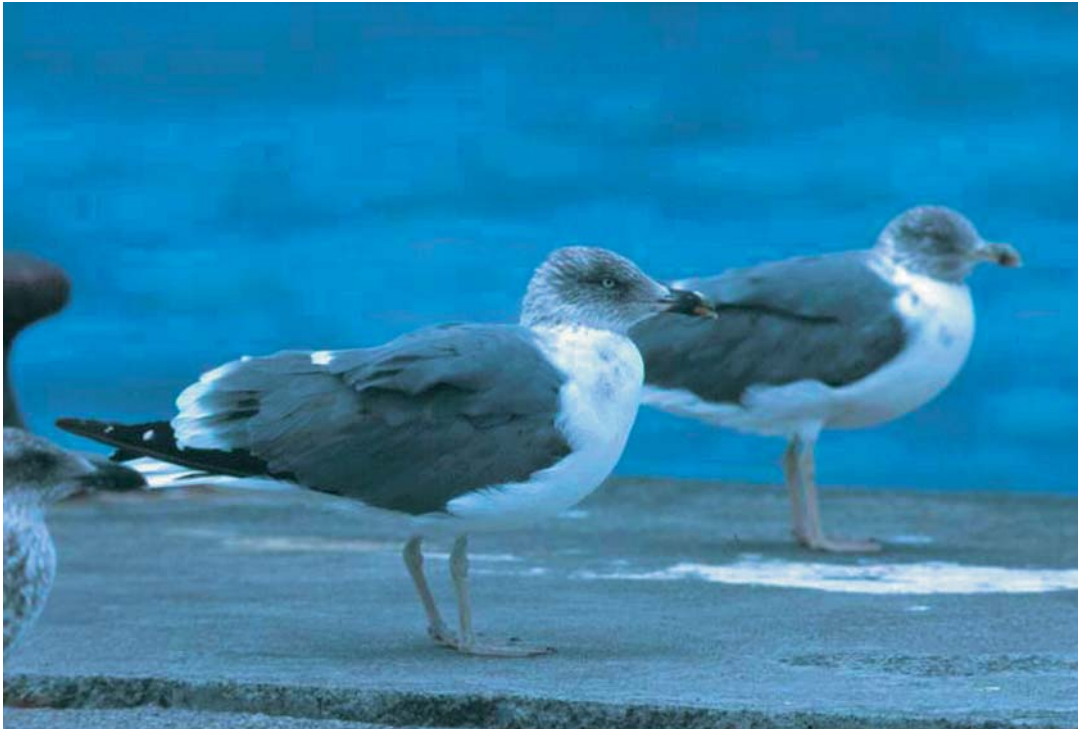
Plate 22. Second-summer/third-winter Azorean Yellow-legged Gull Larus michahellis atlantis , Madalena, Pico, Azores, mid August 2000 (Philippe Dubois). Note the tri-coloured bill and the very pale eye. The rather short legs are pale yellow and their dark markings have almost totally disappeared.